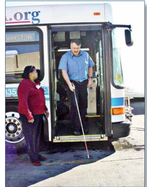
Travel Training can help people with disabilities learn to ride MTA and RTA buses and the Music City Star train with confidence.

To request a Travel Training referral form or to find out more about the program, please call the Travel Training Office at (615) 880-3597.