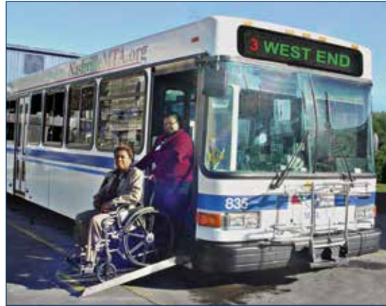
All MTA buses are fully accessible.

Your needs will determine when Travel Training is held. We offer day and evening classes, and training may take place on a weekday or on a Saturday.