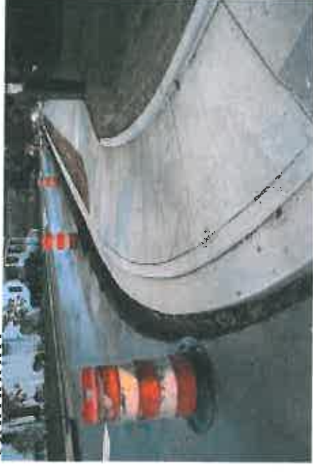
Broader Capital Improvements